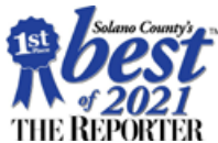
2021 Solano County "Best Of" Awards by Vacaville Reporter Best Bank | Best Credit Union