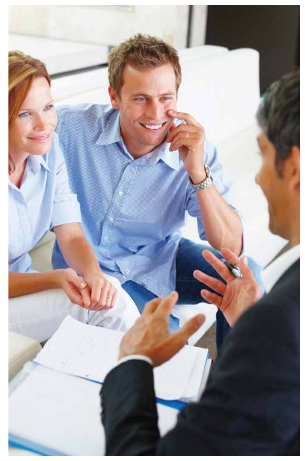
*Excludes FHA/VA and out-of-state loans